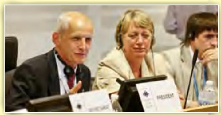
EA President welcomes winners of the EA/CoR Secondary Schools competition 2010

Best practices represent examples which worth to be considering. The feedbacks from participants of the past years' EA/CoR Secondary Schools Competition allowed members to conclude the success of the EA group's project. In this reason EA members have decided to continue addressing to the youth during the year 2011 and continue focusing on the younger generation, bringing them closer to the concept of the European Union and listening their