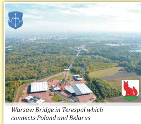
Warsaw Bridge in Terespol which connects Poland and Belarus

We, the inhabitants of the border areas on both sides of the river, do not want a new Berlin Wall on the Bug river.